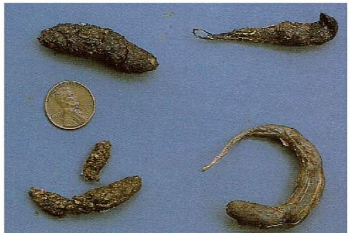
Assorted fisher scat.