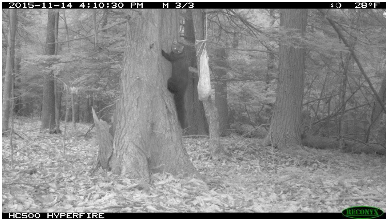
A male fisher, attracted to some bait placed in view of a trail camera at Dyken Pond.