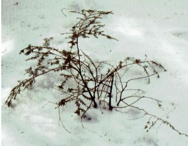
A hemlock sapling that has been “beat up” by a fisher.