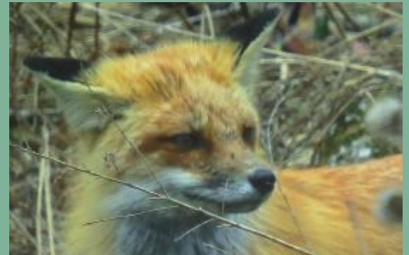
Red Fox picture