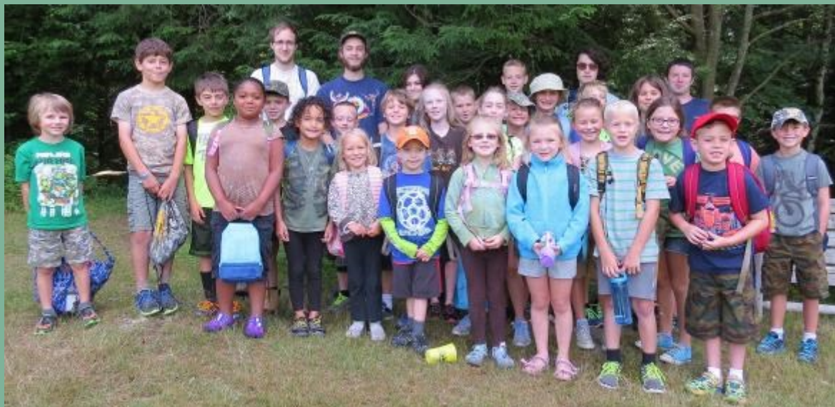
SOLA 2016 Group shot