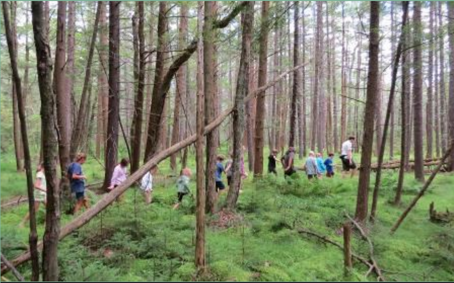
Barefoot bogwalk with SOLA campers